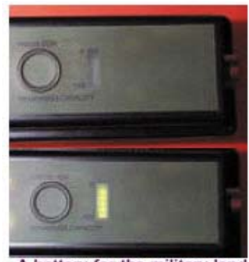
A battery for the military land warrior system utilizes a push button LED fuel gauge.

Often the system is designed with EMI protection but the connection to the battery pack is overlooked, therefore EMI signals are sent back through the battery connection and out of the battery causing interference. Some system designs are so critical that the battery pack needs to be shielded. The most cost-effective way to combat these circumstances is to place the battery pack in a shielded compartment of the system. To place shielding inside the battery pack is usually not cost effective, especially in applications where primary batteries are to be used. Adding shielding to the battery pack can increase the pack's weight and physical size.