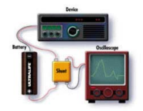
The setup of an oscilloscope and a shunt to monitor current requirements of a device.

The second key parameter needed for adequate battery design is the maximum current requirement. This is an important factor and will influence the battery designer's choice of protection circuitry, chemistry, wire and trace sizes and battery capacity. It is important to remember that the current used to design a system on a bench top using a power supply may be different than the current required from a battery. As discussed earlier, important parameters such as temperature, internal resistance of the battery, and the constant power discharge of a battery will often dictate higher currents at end of battery life. It is important to characterize the current requirement of the system over the entire usable voltage range. Current should always be measured using an oscilloscope and the voltage