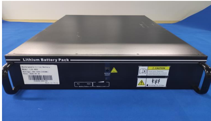
电池图片 Battery picture