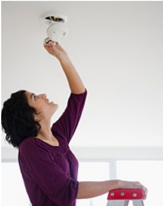
Reduce smoke alarm battery replacement with Ultralife's 10-year 9 Volt battery

Ultralife Corporation offers the highest performing Lithium Manganese Dioxide and Lithium Thionyl Chloride Cells and Batteries available today, with proven performance in critical applications for over 20 years.