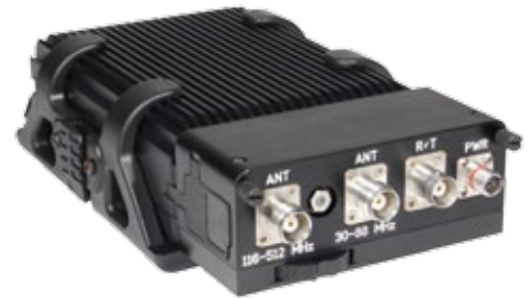
A-320DPA pictured on A-320 series amplifier

More Technical Specifications Available Online