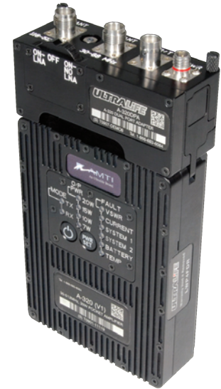
New A-320DPA Dual Port Adapter with LNA functionality fits all A-320 amplifiers.